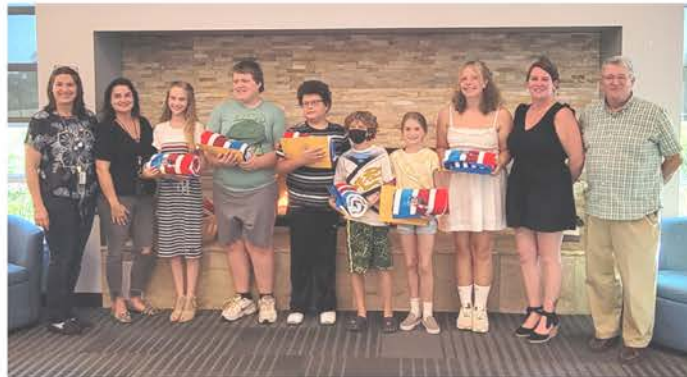
2022 Summer Youth Ambassador Volunteers