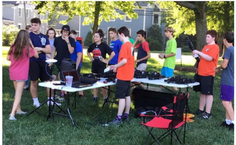
Tactical Laser Tag with Anchors Aweigh Entertainment was a highlight of the summer reading program. 40 teens participated in games at Stango Park.