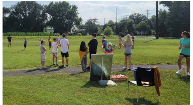
LPL's Teen Summer Sports Series returned for a second season. Teens met on Wednesday afternoons to play games like flag football, wiffle ball, and (crowd favorite) kickball.