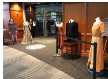
Shakespeare Festival costume display