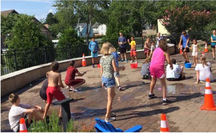
Making a splash at the annual Water Wars! Teens and tweens played water games and had a water balloon fight with over 1,500 balloons.