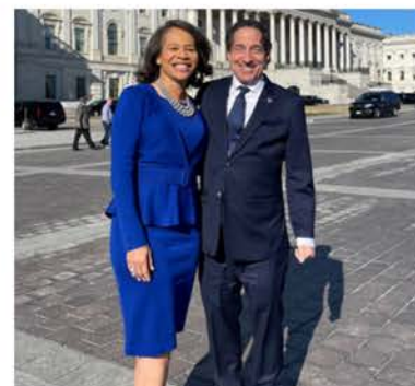
Representatives Lisa Blunt Rochester and Jamie Raskin