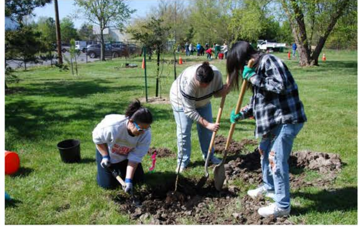
The library's Jane Goodall's Roots & Shoots environmental club partnered with the City of Lewes to plant 25 native trees at George HP Smith Park in Lewes for Arbor Day.