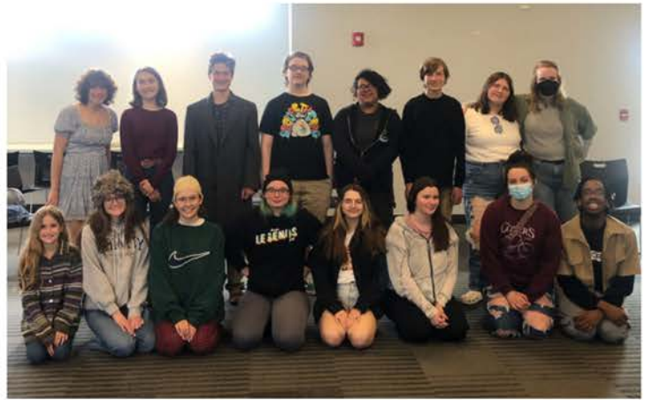
The Writer's Room and the Troupe brought teen writers and actors together to create 5 short plays that were performed in front of a live, public audience.