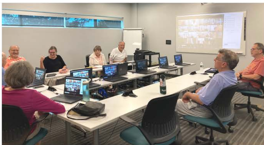
Socrates Cafe members meeting in hybrid format