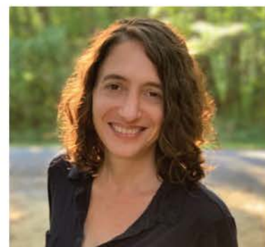
Author Kathryn Schulz