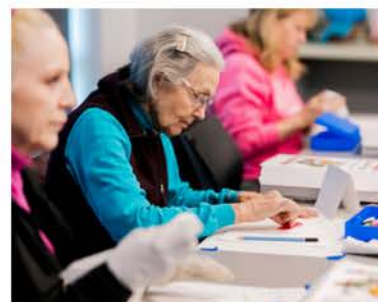
Whimsical Masterpiece pastel art class