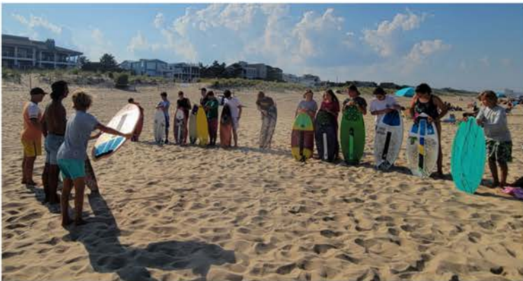
The "Oceans of Possibilities" teen summer reading challenge culminated with a private skimboarding lesson from Alley Oop Skim Camp of Dewey Beach.