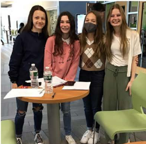
A job interview preparation workshop was offered to participants in advance of the Annual Teen Job Fair , which featured 12 local businesses seeking seasonal and year-round employees.